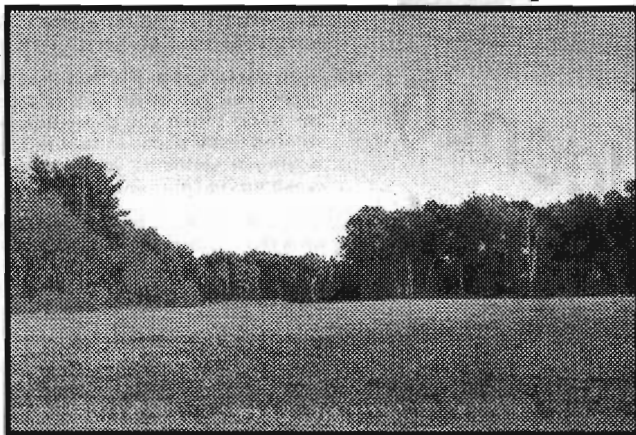
Over 200 years of Family Landowner Management