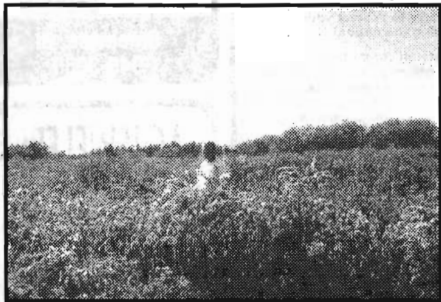
This is what 20 years of Land Trust Mismanagement has done to a green hayfield