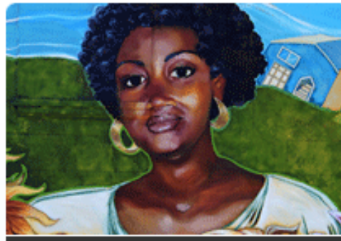
Arts and Culture