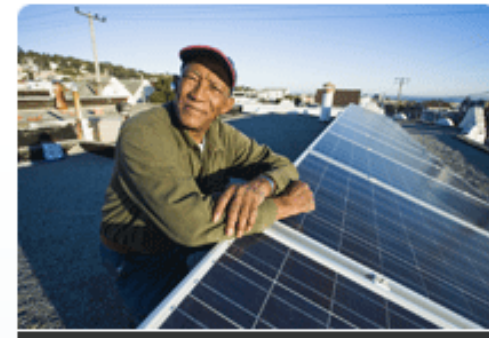
Workforce and Economic Development