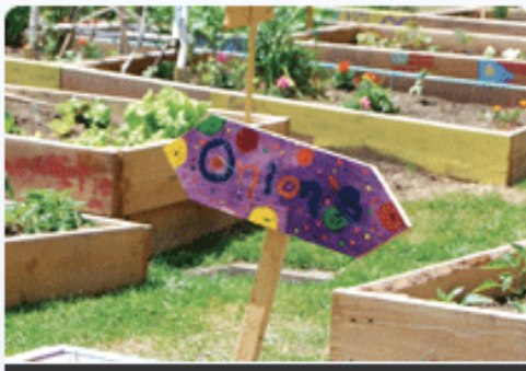
Land Use and Environmental Justice