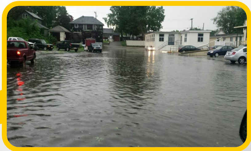
Stormwater-Associated Impairment and Watershed Issues