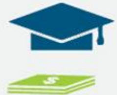
Nonprofits (Churches, Schools, etc.)