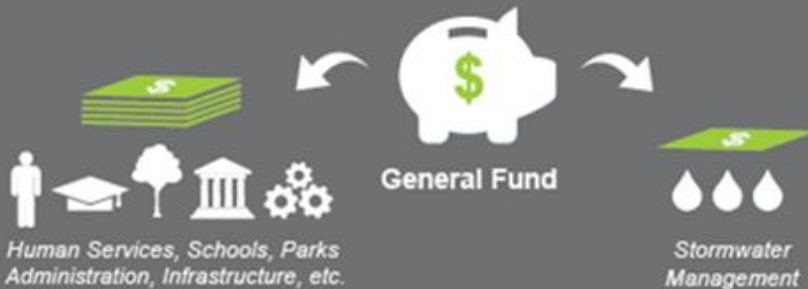
Human Services, Schools, Parks Administration, Infrastructure, etc.