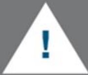
Water Quality Impacts