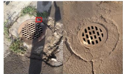
Figure 2—Two of the outdated and inefficient catch basins on Prospect Hill Ave.