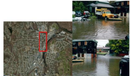
Figure 1—Main Street and Brayton Street location and flooding on Brayton Street property