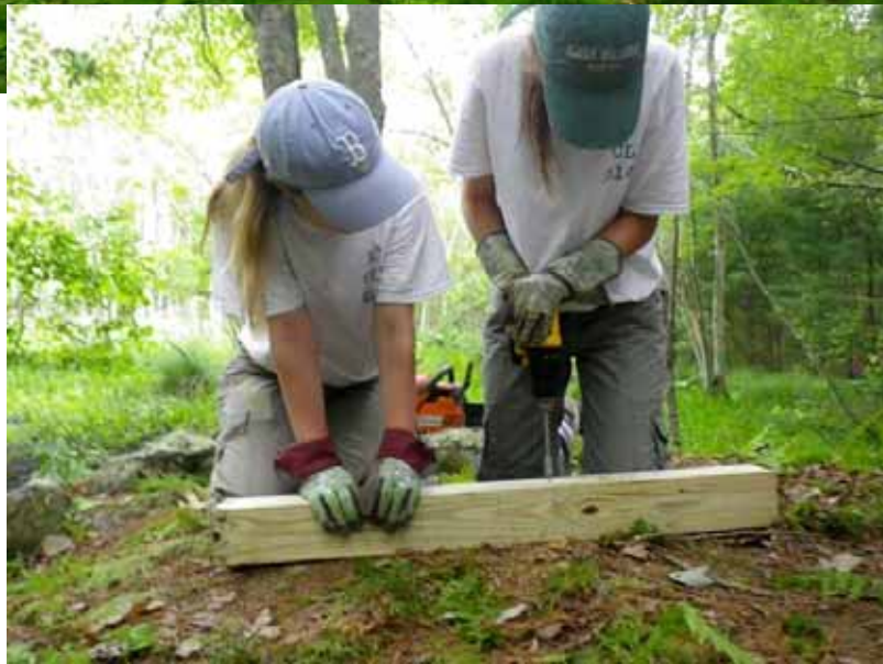
Trail work in W. Greenwich